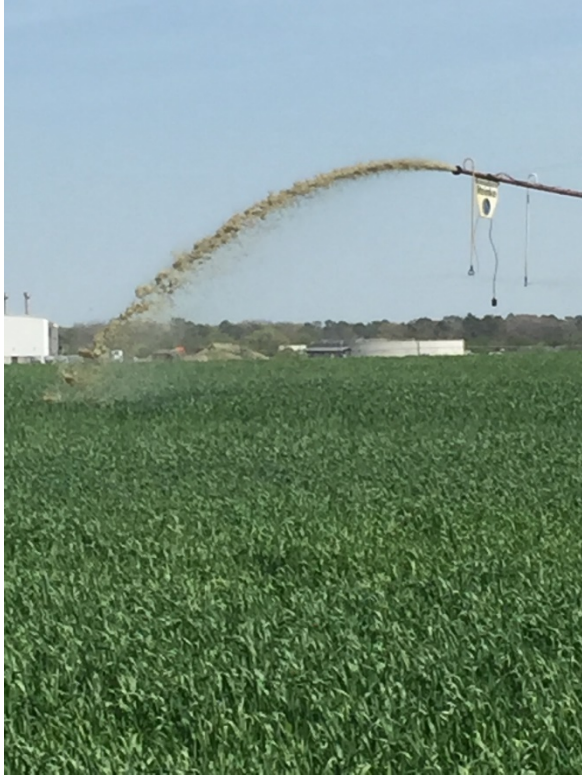
Waste being sprayed by the Mountaire slaughterhouse onto corn fields near people's homes in Millsboro, Delaware, where it has contaminated at least 20 home drinking water wells.

“The smell is so bad, we can’t even go outside our homes to barbecue or anything like that,” said a resident of Herbert Road in Millsboro who asked not to be named because of the ongoing legal action with the Mountaire plant. “We have to just keep our windows closed and our air conditioner on. We can’t drink the water. And it’s impacting our health, too,” he said, holding a package of medication he just picked up from the drug store to treat his chronic stomach and intestinal problems.