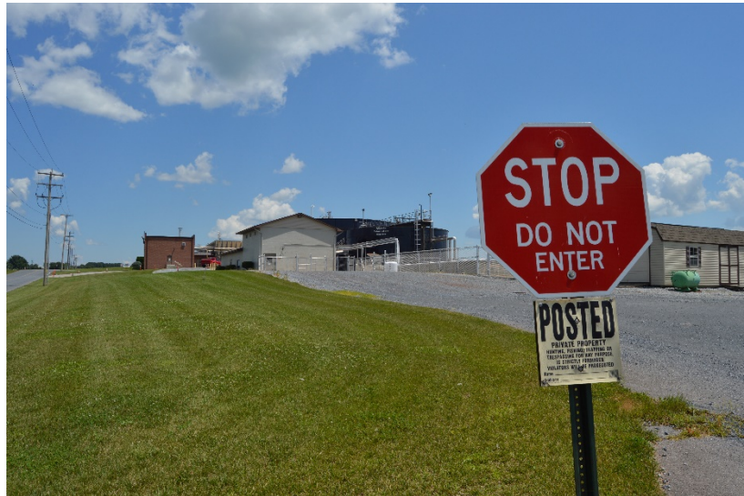
The Keystone Protein Company meat processing plant in Fredericksburg, Pennsylvania, violated its water discharge permit 62 times between January 1, 2016, and June 30, 2018, discharging excessive amounts of nitrogen pollution into a tributary to the Susquehanna River and Chesapeake Bay.

Some plants are chronic violators. Six of the 10 plants listed in Table 4 were in violation of one or more monthly pollution limits at least 50 percent of their operating time since January 1, 2016. These include Simmons Foods in Southwest City, MO, FB Purnell Sausage Co. in Simpsonville, KY, Keystone Protein Co. in Fredericksburg, PA, Tyson Poultry in Sedalia, MO, and Cargill Meats Solutions, Inc. in Schuyler, NE. Keystone Protein, specifically, has failed to meet its monthly nitrogen limits every month since the beginning of 2016, discharging as much as three times what their permit allows.