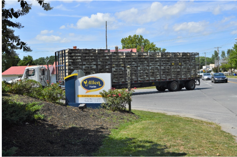
A truck loaded with live chickens drives through the entrance of the Allen Harim slaughterhouse in Harbeson, Del. The plant had more than 90 water pollution violations over four years, including dumping illegal amounts of ammonia and fecal bacteria into a local creek.

This report examines the history of the meat processing industry in the U.S., the sources and impacts of its water pollution, and recommended solutions. We use three local examples in different parts of the U.S. to illustrate different aspects of the industry that make water pollution from slaughterhouses a complex environmental challenge to tackle.