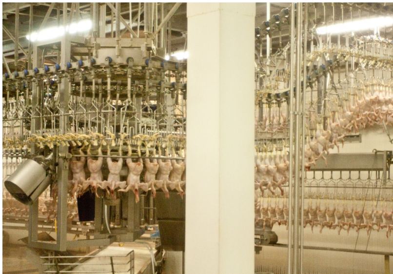
High-speed poultry slaughterhouse conveyor belts have vastly increased production—but can also injure workers.

Things started to change after World War II. With modern refrigeration and changes to how meat was packaged and sold, slaughterhouses no longer had to be close to