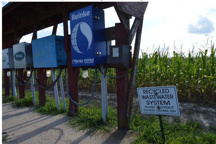
The wastewater pumping system outside at the Mountaire slaughterhouse in Millsboro, Delaware, next to the corn fields, where the waste is sprayed

“These guys are just finding new ways to dump stuff,” said Nidel. “Spray fields are like spreading your garbage in your backyard. It’s not a magic solution. They do not reduce the amount of waste, or change where it is eventually going to go. It’s all going into the environment, one way or the other.”