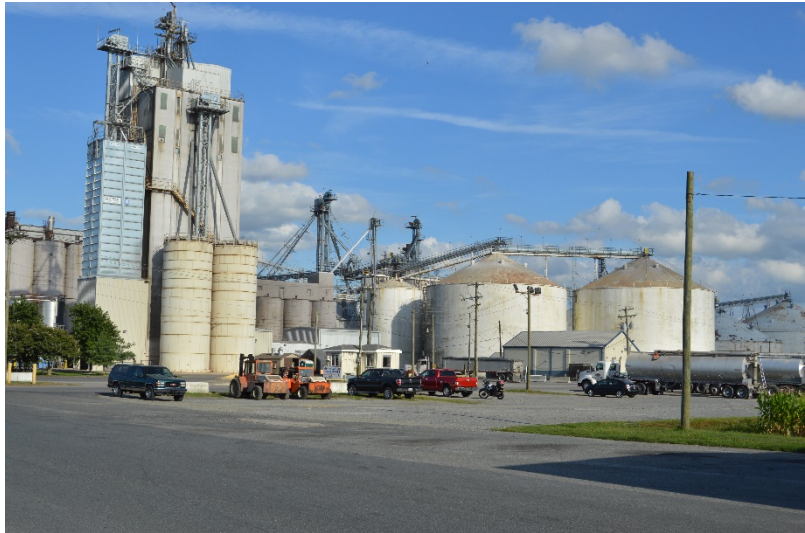
The Mountaire poultry plant in Millsboro, Delaware, whose owners have been sued for contaminating the drinking water wells of neighbors with nitrates and bacteria