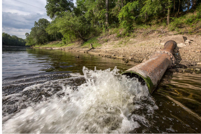
In Live Oak, Florida, wastewater pours from a Pilgrim's Pride meat processing plant into the Suwannee River

In this case, Environment America and the Sierra Club filed their lawsuit against Pilgrim's Pride Live Oak, a Florida-based chicken processing plant that already had a history of citations from environmental regulators for wastewater violations. The groups alleged that since 2012, the company had violated the Clean Water Act on 1,377 days, and that discharged wastewater had as much as tripled legal pollution limits.