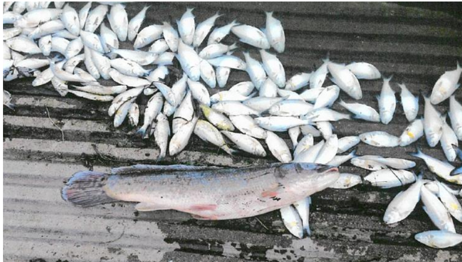
A spill of 29 million gallons of hog waste from a JBS meat processing plant in Beardstown, Illinois, killed 64,566 fish in tributaries to the Illinois River in 2015.

Beardstown is a small, rural community of only 6,000 people, and many of the 2,000 workers in the plant are immigrants, many from Mexico and about 30 other countries in Latin America, Africa and elsewhere. “Lower wages, along with increases in work speed and injuries – a trend in meatpacking plants across the Midwest in the late 1980s – made jobs less attractive for most white skilled workers,” according to a Reuters news report on the plant. 33 “Latino immigrants started coming to Beardstown, once an all-white town