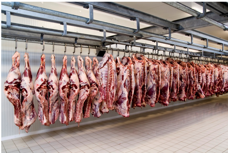
Many large meat processing plants in the U.S. today are owned by international companies based in Brazil, China, Arkansas, and elsewhere, making control and management decisions more remote from the pollution impact in rural American communities

Although the industry is more mechanized than it was a century ago during the days of Upton Sinclair’s The Jungle , the killing, evisceration and cutting still relies heavily on repetitive human labor with bolt guns (to kill cattle), saws, knives, rods, hooks, conveyor belts, and forklifts. 9 The work can still be dangerous. For example, an inmate on a work-release job at a poultry plant owned by Koch Foods was killed in an industrial accident in Ashland, Alabama, in 2017. 10 A contract sanitation laborer died at a Tyson’s plant in Shelbyville, Tennessee, after he tumbled into equipment he was cleaning in 2015. 11 Another slaughterhouse worker was found dead in an “ice room” at Pilgrim’s Pride plant in Mount Pleasant, Texas, in 2014. And a paddle in a liver giblet chilling vat ripped the leg of a 17-year-old immigrant worker from Guatemala at a Case Farms poultry plant in Canton, Ohio, in 2015. 12 Thirty-four percent of U.S. slaughterhouse employees were Hispanic or Latino in 2017, and the average hourly wage was $13.46. 13